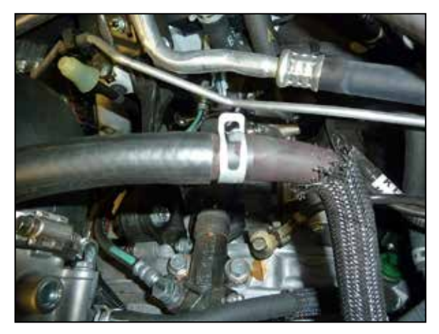
22. Install the crank case vent hose assembly into the factory crank case vent hose and secure with the factory spring clamp.