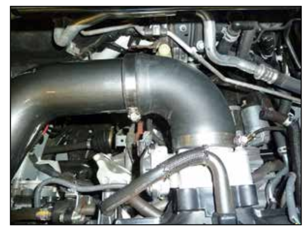
20. Align the intake tube for best fit and then secure the coupler hose clamp

19. Reaching in through the fresh air opening in the heat shield, retrieve the mass air sensor wiring pigtail laying on the frame and connect it to the mass air sensor. Check to make sure that the wire is not pinched or bound with could cause damage to the wiring.