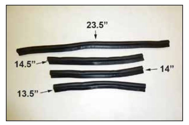
9. Cut the provided edge trim into four sections, 23.5", 14.5", 14" and 13.5".

NOTE: The Mounting nut will be reused in a later step.