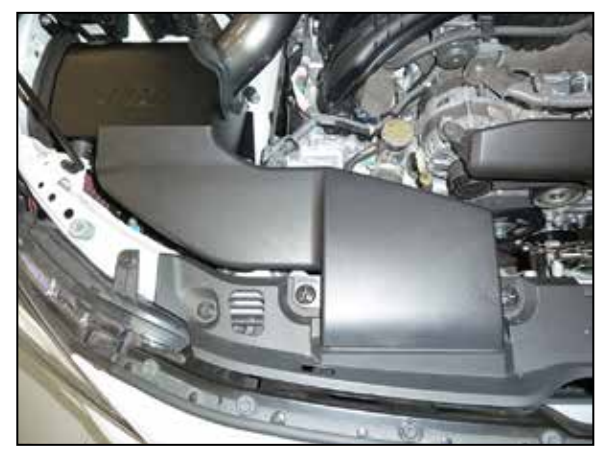
24. Reinstall the factory fresh air intake duct and secure with the factory hardware.