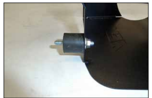
10. Install the provided rubber mounted stud onto the heat shield using the factory nut.