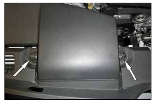
2. Remove the two clips that secure the fresh air intake duct and then remove the duct from the vehicle.

disconnecting the negative battery cable. Some radios will require an anti-theft code to be entered after the battery is reconnected. The anti-theft code is typically supplied with your owner's manual. In the event your vehicles anti-theft code cannot be recovered, contact an authorized dealership to obtain your vehicles anti-theft code.