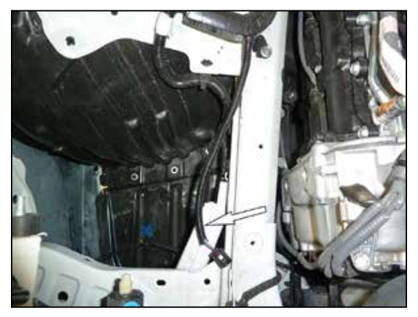
15. Position the mass air sensor wiring pigtail along the frame as shown.

14. Install the provided 90° coupler onto the throttle body but do not completely tighten the hose clamp at this time.