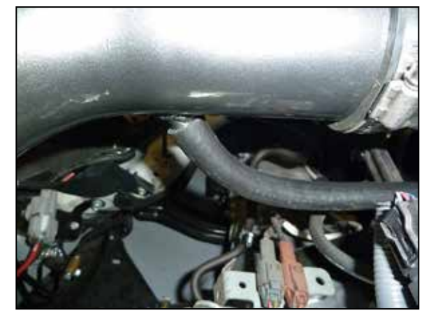
23. Connect the open end of the crank case vent hose to the fitting on the AEM^{\circledast} intake tube.